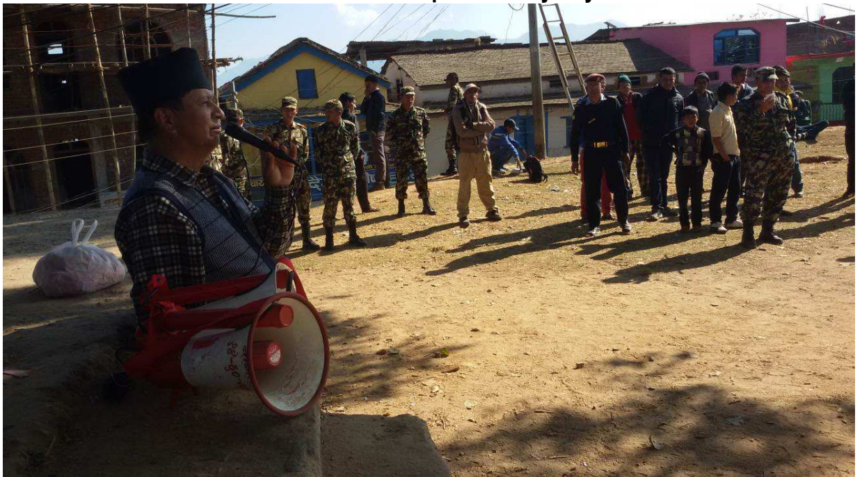
Chief District Officer, Coordinator DDRC, Dailekh