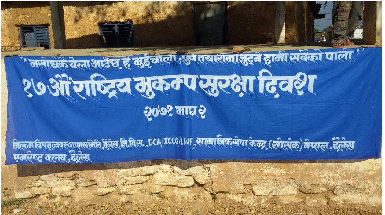
Main Banner of Earth quake Safety Day 2071